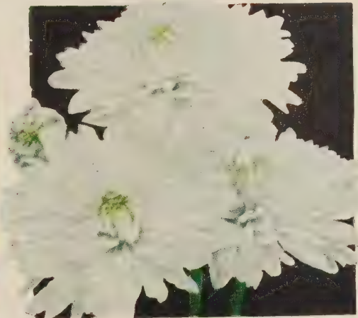
ERMINE. 60c each; 3 for $1.50